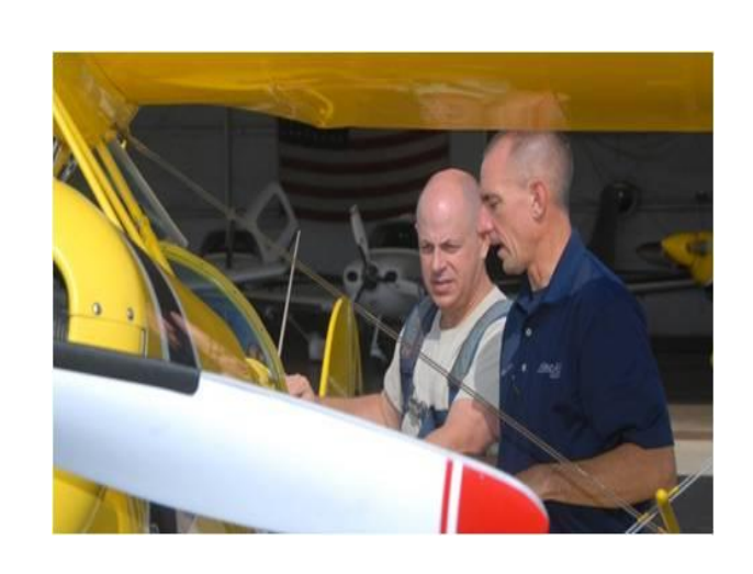
Long-term Asset to County