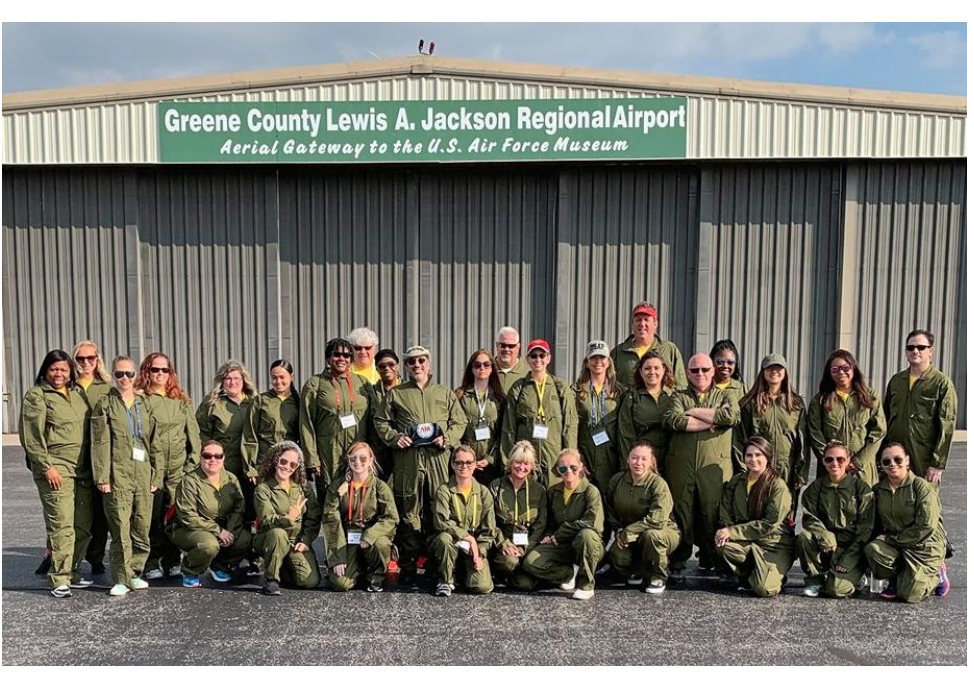
Providing value to the community