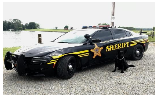
Civil Services (Police, Fire, EMS)