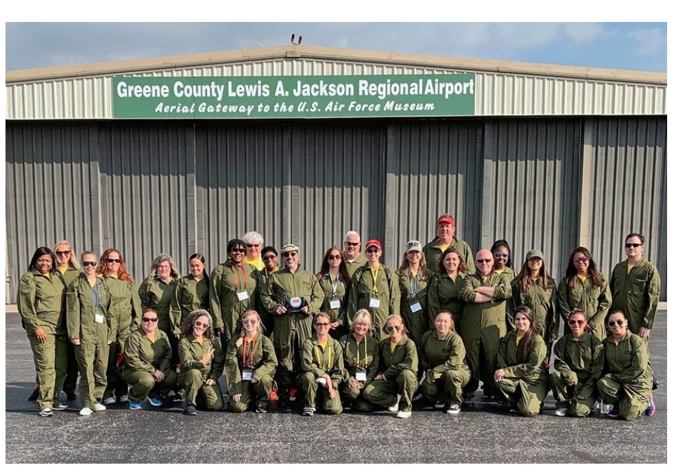
Providing value to the community