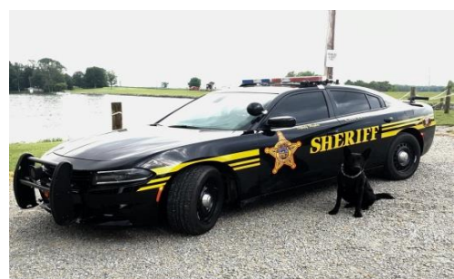
Civil Services (Police, Fire, EMS)