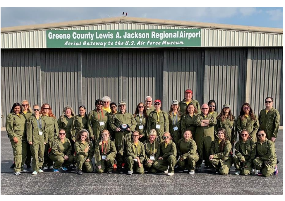
Providing value to the community